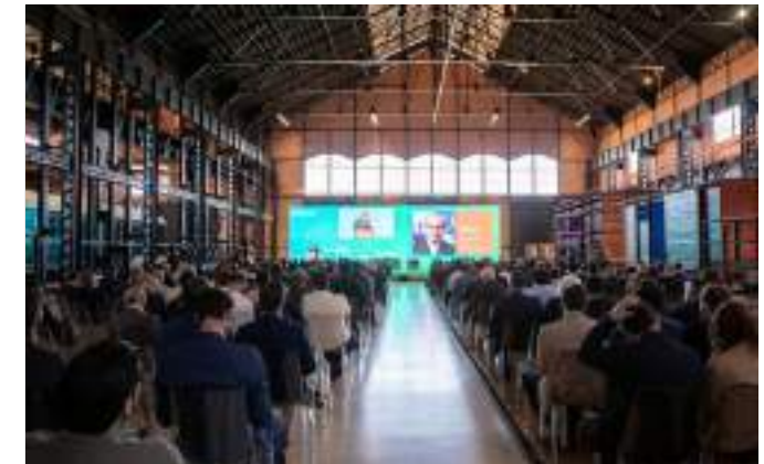
6th Edition | Entroncamento, May 2025