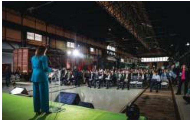
5th Edition | Entroncamento, May 2024