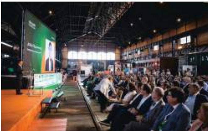
4th Edition | Entroncamento, May 2023