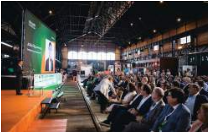
4th Edition | Entroncamento, May 2023