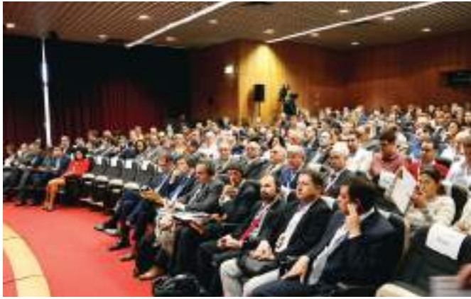
1st Edition | IP - Infraestruturas de Portugal, November 2019