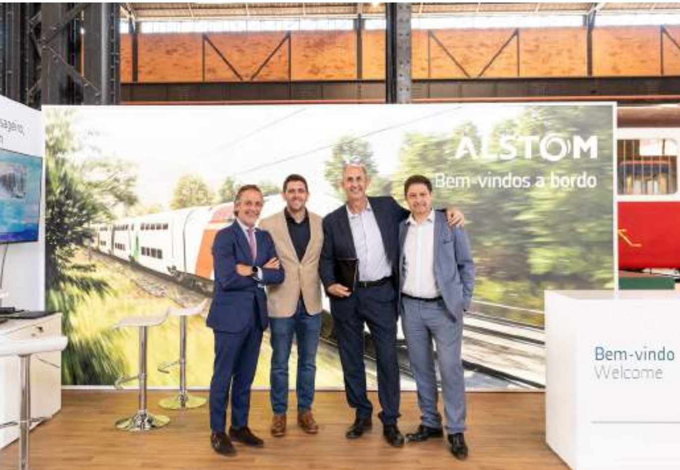
Stand 6x2m | Master Platinum Sponsor - example