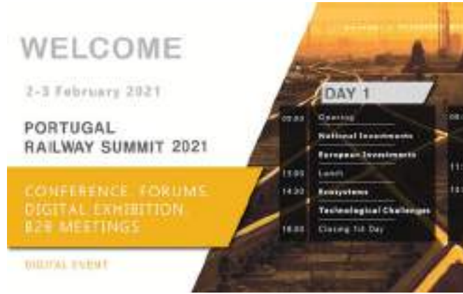
2nd Edition | Online Event, February 2021