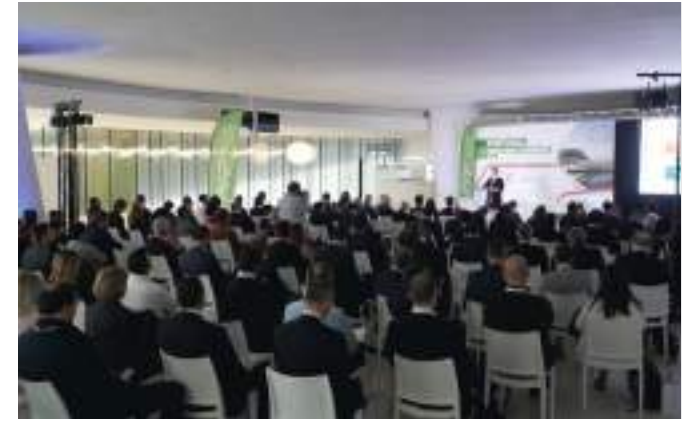
3rd Edition | Porto de Leixões, May 2022