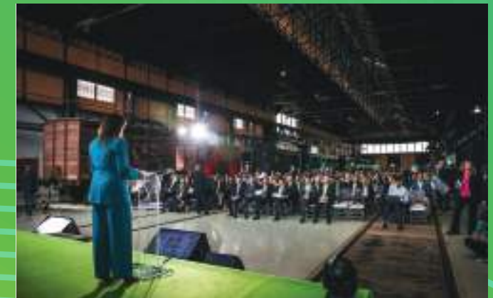
5th Edition | Entroncamento, May 2024