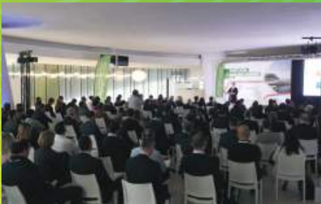
3rd Edition | Porto de Leixões, May 2022