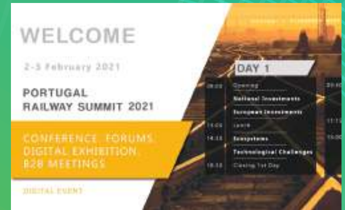
2nd Edition | Online Event, February 2021