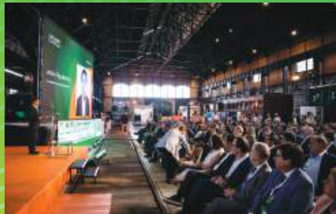
4th Edition | Entroncamento, May 2023