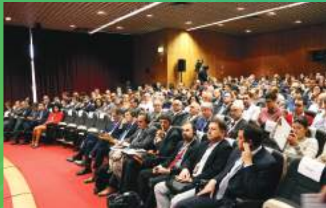
1st Edition | IP-Infrastructure of Portugal, November 2019